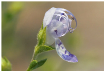
Curled stamens and style