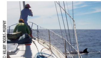
Whale research in the Gully.