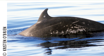
Scarring and triangular dorsal fin.

Stewardship: Report distressed or dead marine mammals to MARS: 1-866-567-6277