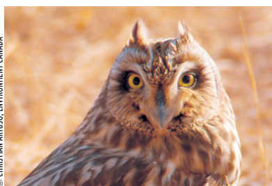
Feather “ear” tufts