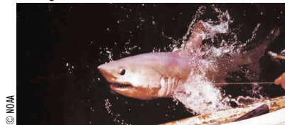
Porbeagle Shark caught on a longline hook