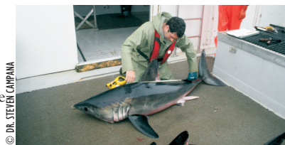
Porbeagle Shark research