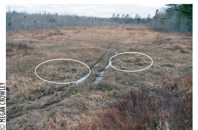
OHV tracks beside Long's Bulrush plants

Tell others about ACPF and how they can help! Many people living with these unique species do not realize how rare these species are and how special Nova Scotia is! The species featured in this guide are found nowhere else in Canada and Nova Scotia has some of the most intact habitat remaining for these species in the world.