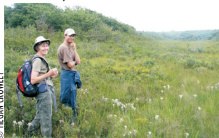
White woolly hairs