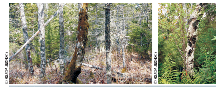
Blue Felt Lichen requires mature trees and a pollution-free environment. It also occurs infrequently in Newfoundland and New Brunswick.

Blue Felt Lichen is found in coastal forests that are typically cool, humid, rainy, foggy and close to sea level. It is found in mixedwood forests with Red Maple and Balsam Fir and sometimes in mature hardwood forests of Sugar Maple and Yellow Birch. It grows on mature trees near areas that maintain locally high humidity levels including poorly drained wet depressions and areas close to wetlands, streams and lakes. The vegetation is typically dominated by Sphagnum moss and Cinnamon Fern.