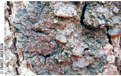
Dry Blue Felt Lichen